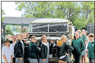
Students from Blackalls Park Public explore the historic vehicle.