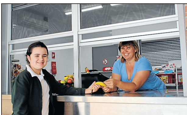
The Blackalls Park canteen has a fresh new look after undergoing an upgrade.