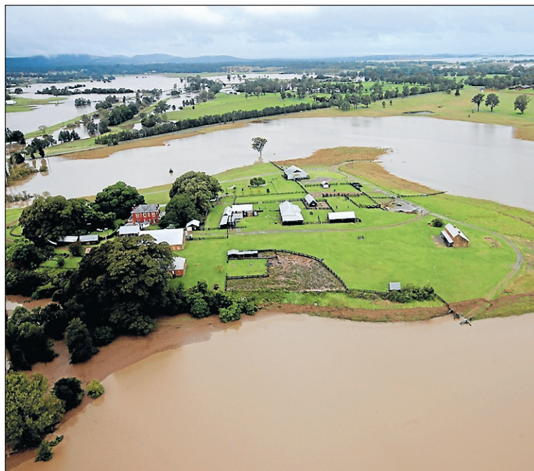
Many homes were cut off by floodwaters during the April super storm. Some are still recovering.

This storm was the most significant since the 2007 Pasha Bulker. Over 80 schools were closed due to safety concerns and around 100,000 houses, hospitals, schools and businesses were without power for three plus days. Some went without water. With more than 4500 urgent hazards in Newcastle, residents were warned that it would take several days to get their power back. The SES rescued 47 people from rooftops and flood water across Newcastle. Despite the efforts of emergency services, many people are still experiencing