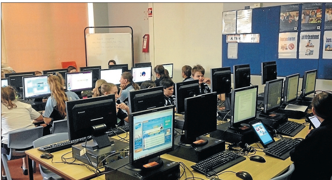
Computers and technology are an everyday part of the modern classroom.

Ninety-one per cent of teachers say using technology in schools is