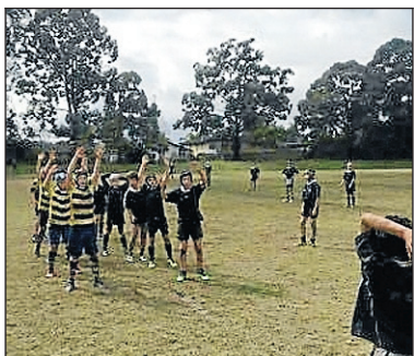
East Maitland Public rugby team in action.