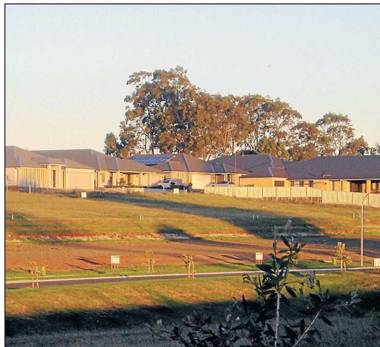
There are new developments being built around Largs, including Dunmore Ridge.

does not like that the skate park is now busier and he has to wait in line for a turn. "We have to line up and wait for a turn. Years ago there were less kids and no waiting," he said.