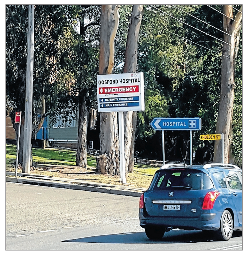
The NSW health system is under great pressure from too many patients and not enough staff and medical facilities.

Hospitals are too busy and inundated as patients with minor injuries are being treated at the hospital therefore creating much