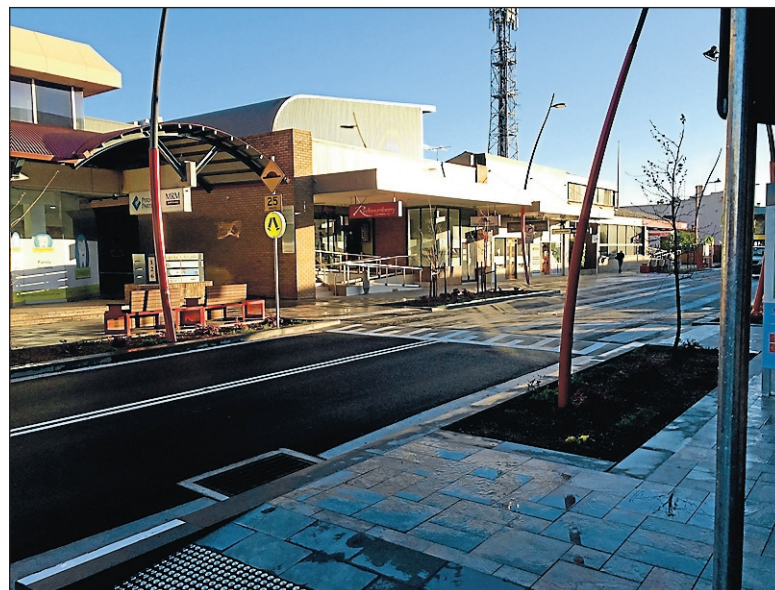
John Street's new look after the multi-million dollar upgrade.

assist pedestrians and motorists were installed.