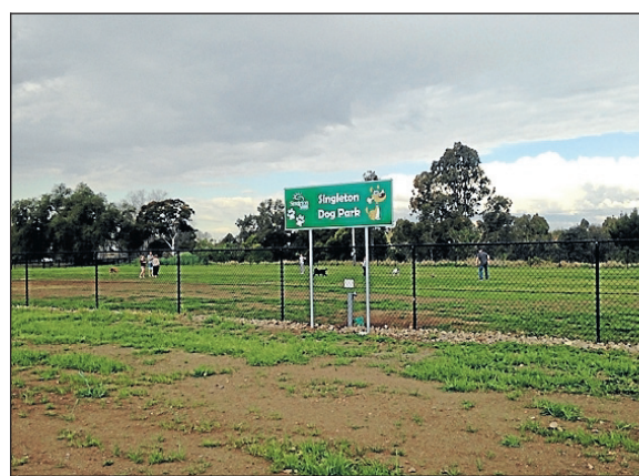
Dogs having fun at the dog park.

And if your dog does a doo-doo there will be bag dispensers and bins available at the park for free. It was built so dogs were free to run around and have fun.