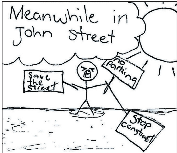
Cartoon: Fletcher King