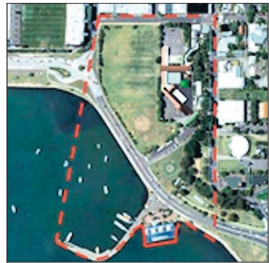
Site for proposed waterfront development.

More regular activities include: monthly Monday assistance in the restaurant, providing music on various occasions in the restaurant, helping with the annual Homeless Memorial Service and school food drives throughout the year.