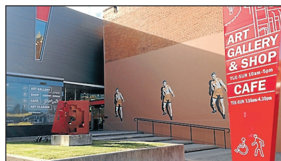
The art gallery is just one of the places you can visit.

skate parks, Maitland Mall and Reading Cinema. Visit maitlandhuntevalley.com.au and browse the exciting and entertaining events listed.