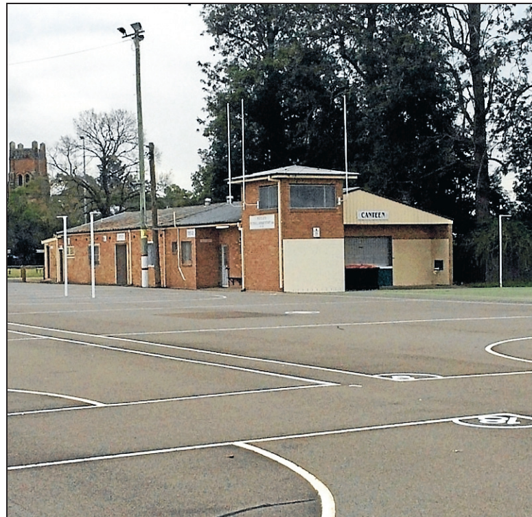
The netball court clubhouse will be upgraded this year.