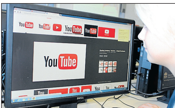
There are millions of videos on YouTube, making it hard to stand out.

With continued effort and assistance from those involved, hopefully one day soon, this stormwater drain and waterway will be cleaned up and restored to its original glory.