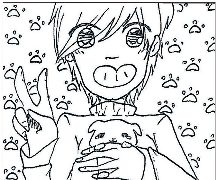
Cartoon: Skye Duncan-Lindley