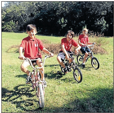
BMX boys are eager for the park to open.