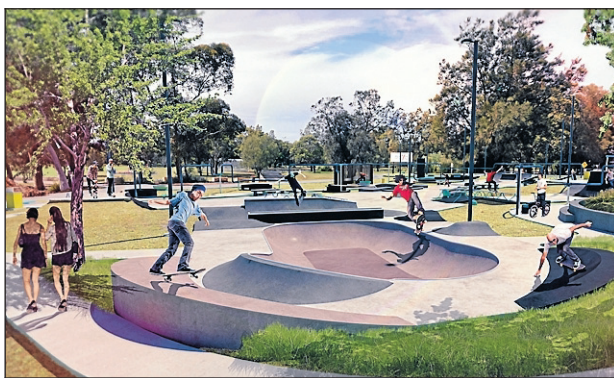
An artist's impression of the new skate park.

House and The Entrance Community Centre Gallery and Workshop. Together these facilities provide a diverse range of spaces aiming to meet all local and visitor needs.