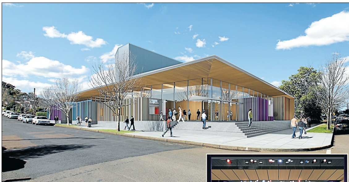
An artist's impression of the new performing arts building.

The 500-seat auditorium and 130-seat studio is costing over $12.7 million dollars and is hoped to be a great success. The Art House capital cost is consistent with other local government capital recreational and leisure projects such as sports fields and facilities. However, some debate is building on where the parking for this facility will be. There will be 21 parking spaces on site and some street parking for weekend and non-business hours events. As the Art House is located in the Wyong township, it will have good connections to public transport with easy access to the Pacific Highway and