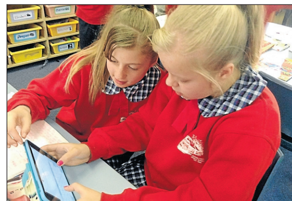
Wyong Creek Public students love working with their iPads.

Next we will be learning about 3D printing with ScopeIT. We plan to design a collection of items that can be printed in 3D.