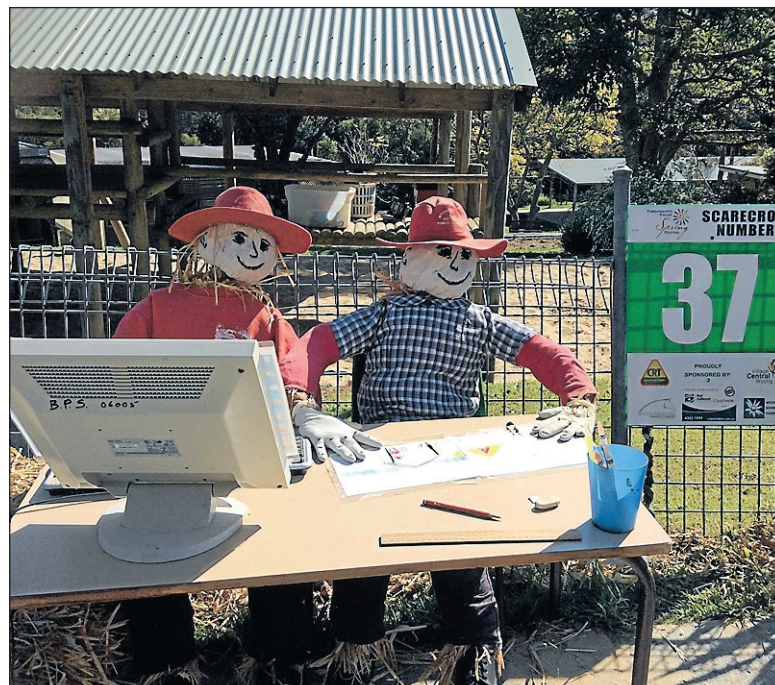
Wyong Creek Public School's winning scarecrow entry.

One of the popular events is the gruelling Bumble Hill Burn. A crazy 6.2-kilometre run with a gradient going to 300-metres above sea level.