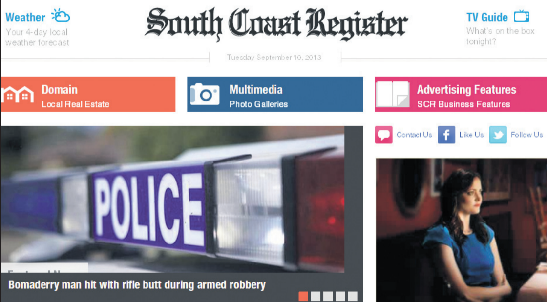
The South Coast Register's website has had 3.9 million page views so far this year.