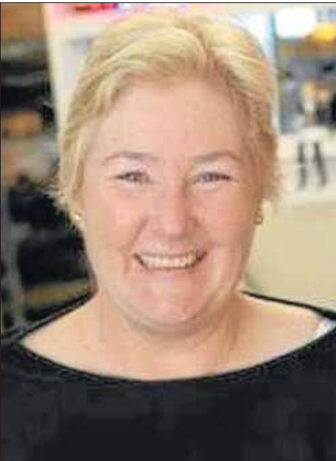
REPRESENTATIVE: Federal MP Ann Sudmalis pays tribute to local Shoalhaven women.