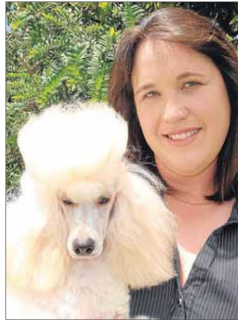
PRETTY PET: Snuggle Pup and Cuddle Pooch's Sharon Hall will have your pet looking perfect.

For more information call Lyn on 0402 254 042 or email lje196@gmail.com.