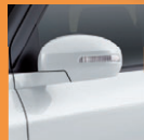
Side mirror indicators