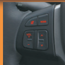
Steering wheel audio controls