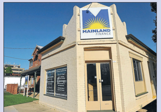
Now at 94 Morgan Street (Cnr Peter St) Wagga Wagga – commercial finance specialist