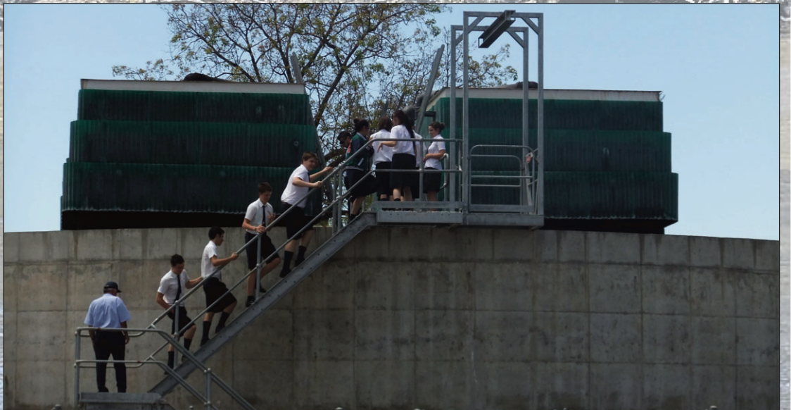
The Riverina Anglican College students on an excursion to a Riverina Water processing facility as part of their chemistry studies.

Bungendore Water Bores are committed to sustainable industry practices and use only modern, environmentally efficient drill rigs and equipment.