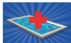
Emergency Pool Servicing