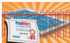
Safety Inspection & Fencing