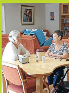
Friends meet in one of the beautifully refurbished living / dining areas.

Located at 156 Bourke Street, Wagga, The Haven can be contacted by phoning 6925 5500, or visit the website at www.haven.net.au .