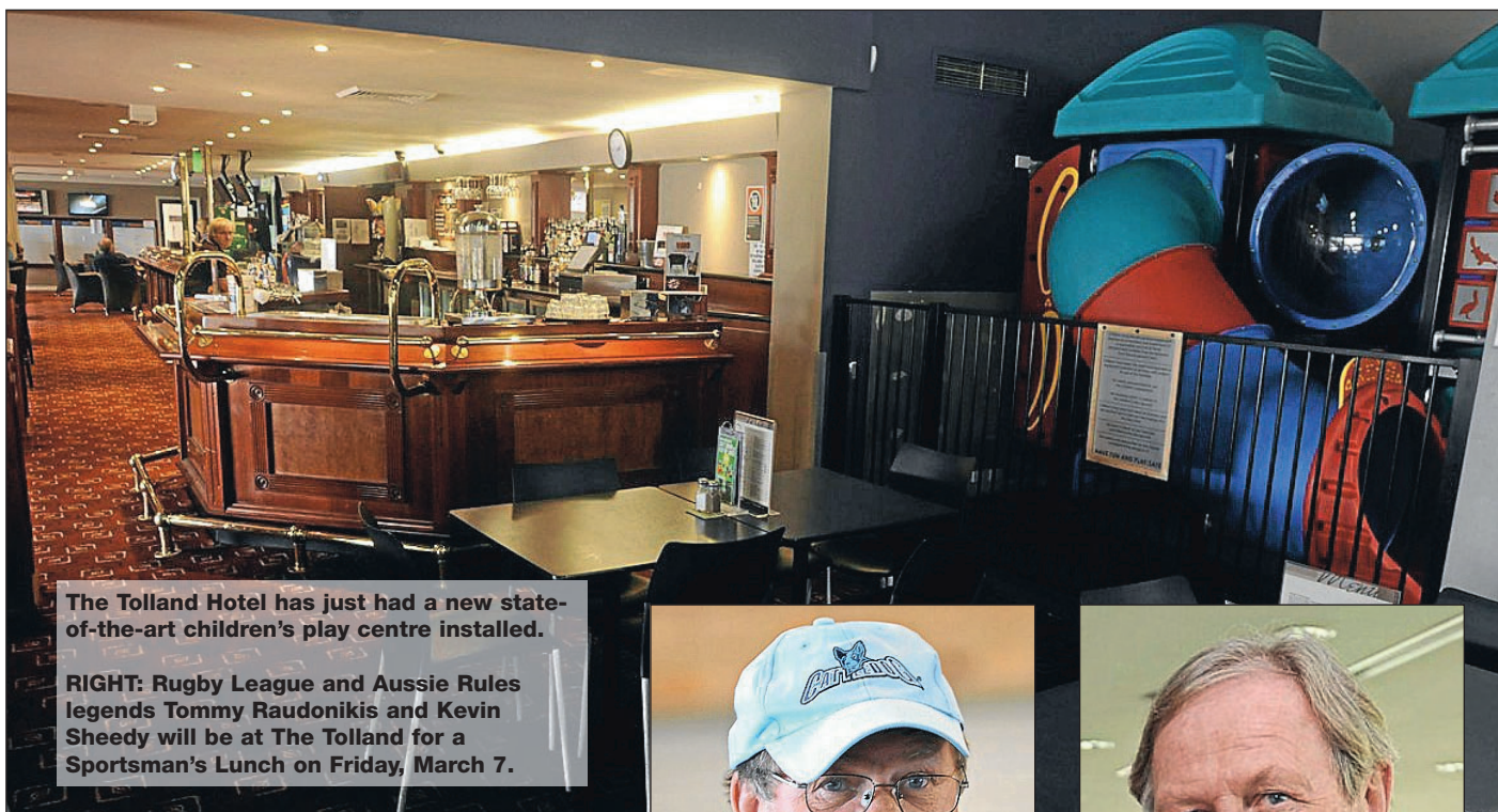
The Tolland Hotel has just had a new state-of-the-art children's play centre installed.

The pub will be the place to be from noon on Friday March 7 for the Tolland Hotel 40th