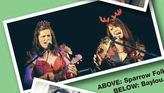
ABOVE: Sparrow Folk. BELOW: Baylou.