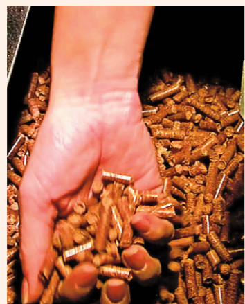
♣ Recycling: Firemaster burners run on wood pellets made of compacted sawdust.

Whatever the make and model there are spare parts and heaps of accessories, including hearths, fire tools, flues and even insulation to keep all that warm air in.