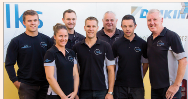
♣ Same friendly faces: The Laser Electrical team is ready to serve

Laser Electrical Inverell can also offer a Flexi-rent option to all approved commercial or domestic clients to assist in the cost of your new air conditioning system. Just ask their friendly team for an obligation-free design and quote today.