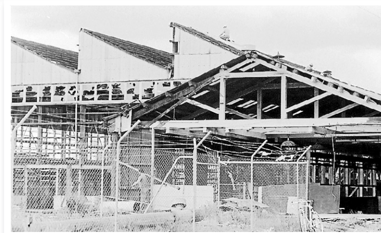
Right: RENOVATIONS: Renovations underway at the defunct Per Way Workshops in Sloane St, south of the Goulburn Railway Station, September 22, 1988.

Goulburn Produce MIGHTY HELPFUL MITRE 10