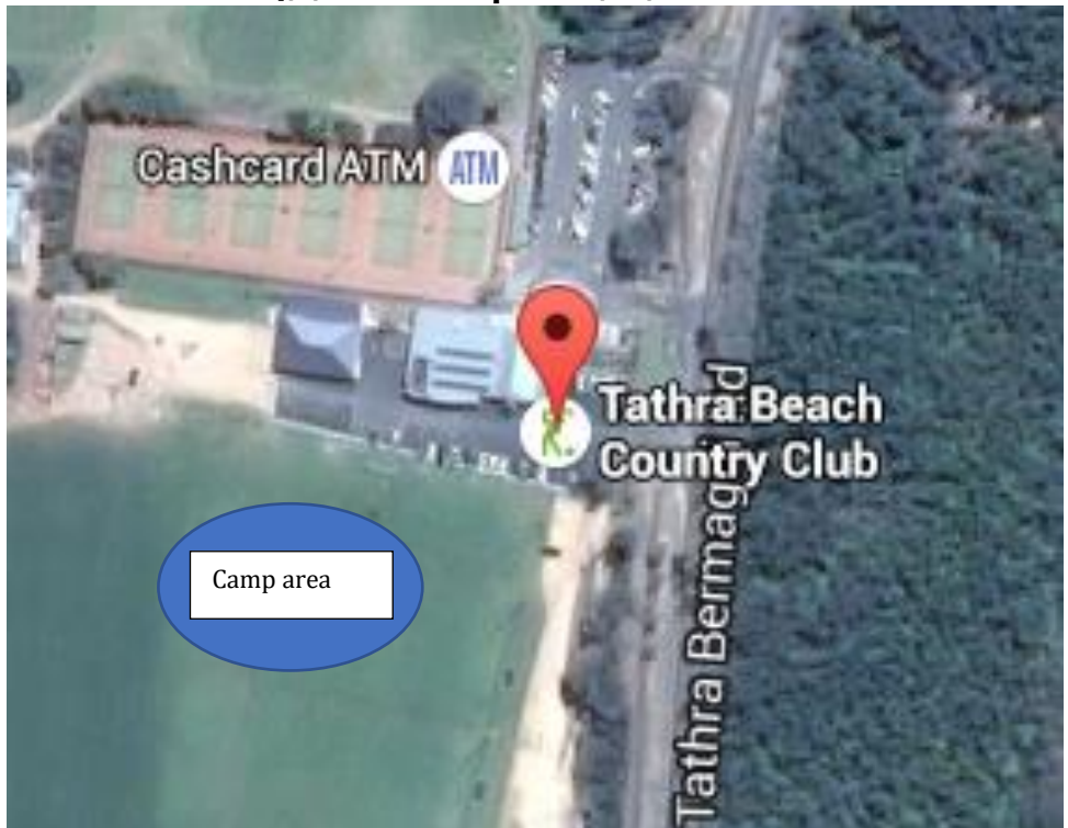
Tathra Country Club available from 4/1/2018 to 12pm 08/01/2018

Facilities available – showers and toilets.