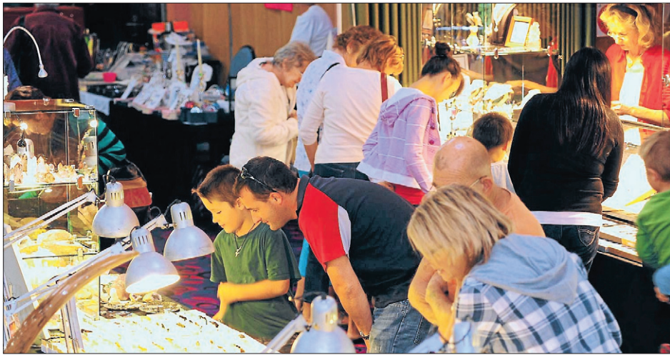
Plenty to see: The Services Club was aglow with gem-lovers last year.

There's already a well-established buzz on ALF (the on-line Aussie Lapidary Forum hosted by Glen Innes's own Aussie Sapphire Warehouse) about Minerama, so a glittering time is anticipated this weekend.