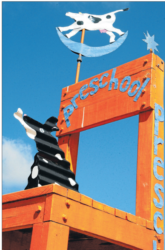
HIGH CHAIR: Walcha's open-air gallery will surprise and delight with its size and variety.

AT THE suggestion of the Walcha Arts Council, Walcha Council has adopted the concept of developing Walcha as an open-air gallery.