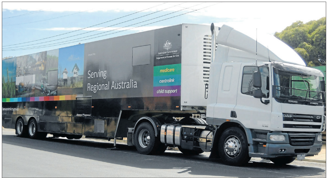
SERVICES ON THE ROAD: Desert Pea, the Australian government's mobile service centre will visit Curlewis and Barraba later this month.