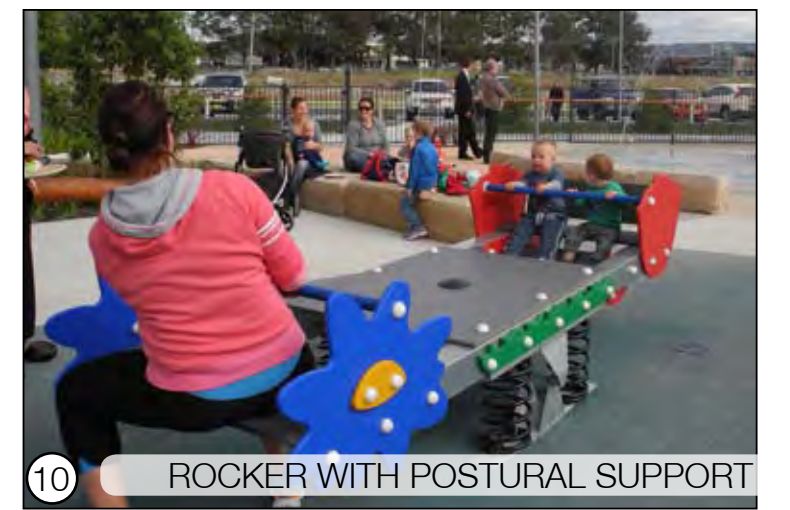
10 ROCKER WITH POSTURAL SUPPORT