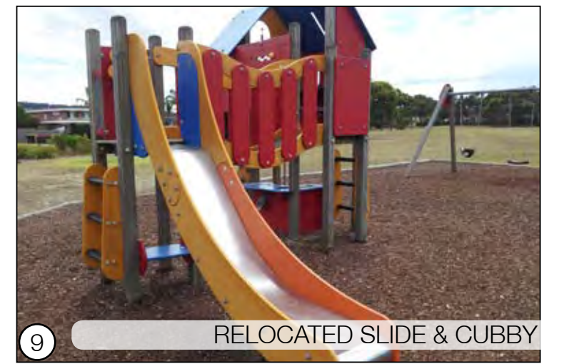
9 RELOCATED SLIDE & CUBBY