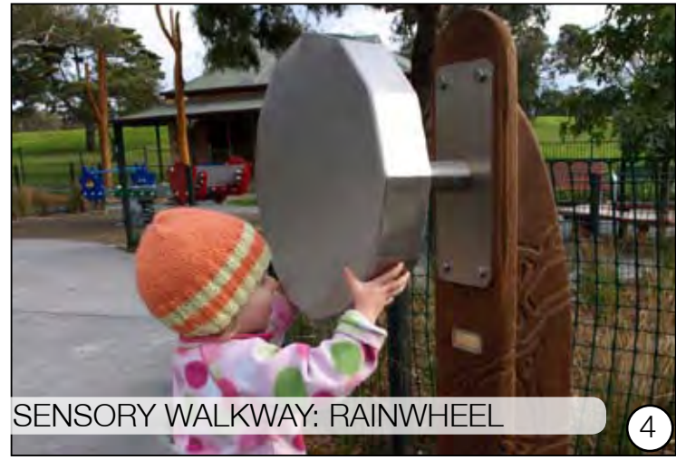
4 SENSORY WALKWAY: RAINWHEEL