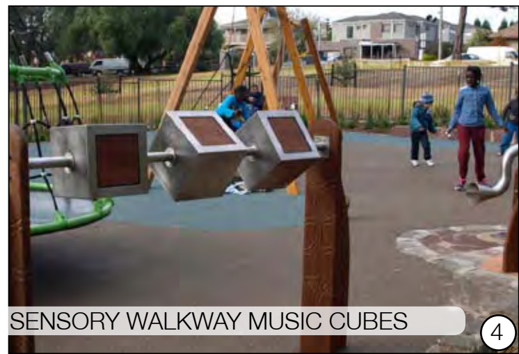
4 SENSORY WALKWAY MUSIC CUBES