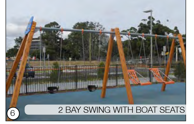
6 2 BAY SWING WITH BOAT SEATS