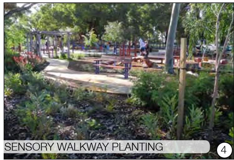
4 SENSORY WALKWAY PLANTING