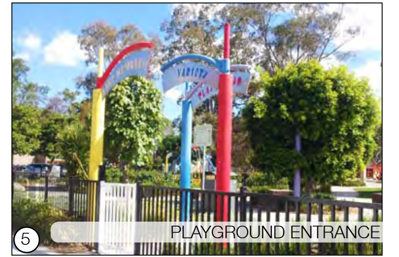
5 PLAYGROUND ENTRANCE