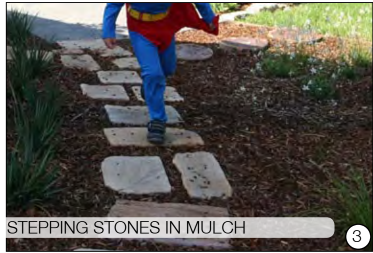
3 STEPPING STONES IN MULCH