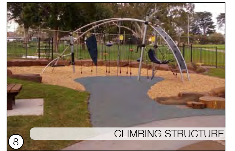
8 CLIMBING STRUCTURE