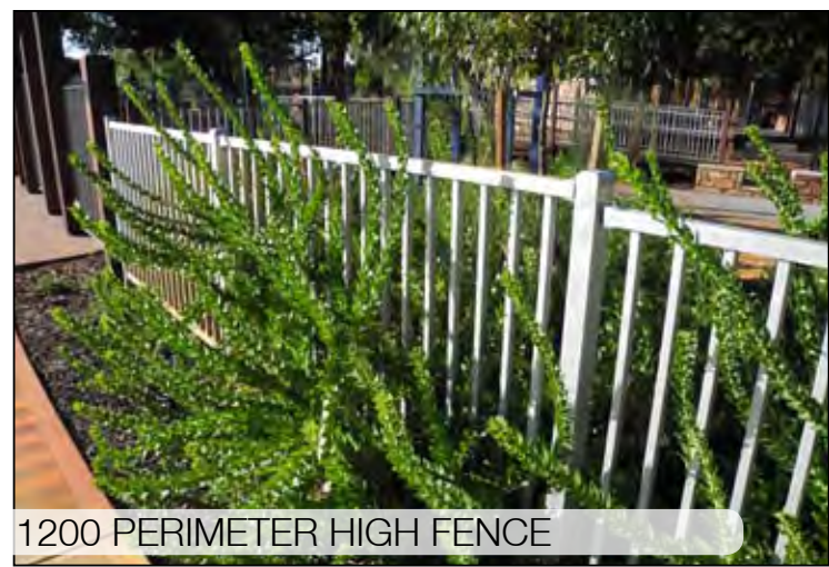
1200 PERIMETER HIGH FENCE