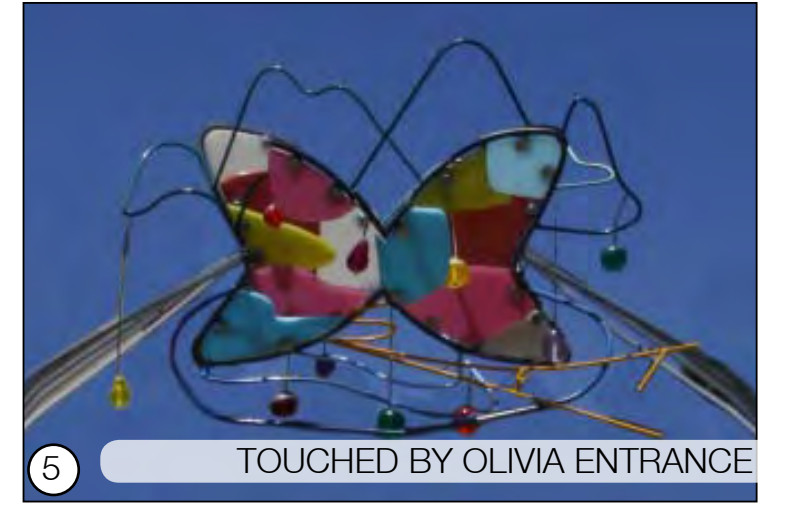
5 TOUCHED BY OLIVIA ENTRANCE