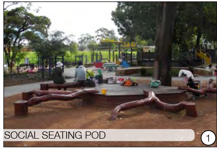
1 SOCIAL SEATING POD