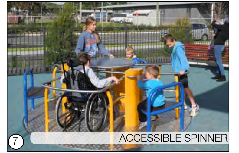
7 ACCESSIBLE SPINNER