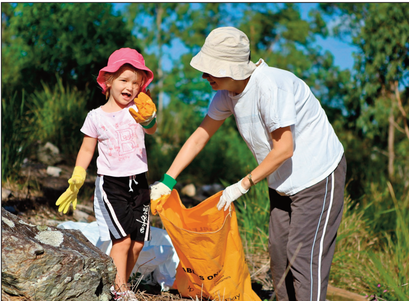
Help clean up Queanbeyan this Sunday as part of national Cleanup Australia Day. For details, visit www.qcc.nsw.gov.au .

If you would like to volunteer on Clean Up Australia Day 2 March please register on line at www.cleanupaustraliaday.org.au and find a site near you.