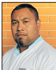
Tangi Maine Prop