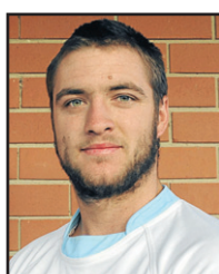
Zac Tarrant Centre