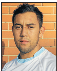
Rob Howe Centre