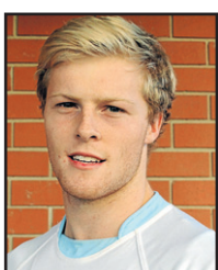
Tom Christian Centre