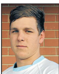
Tom Holland Back row