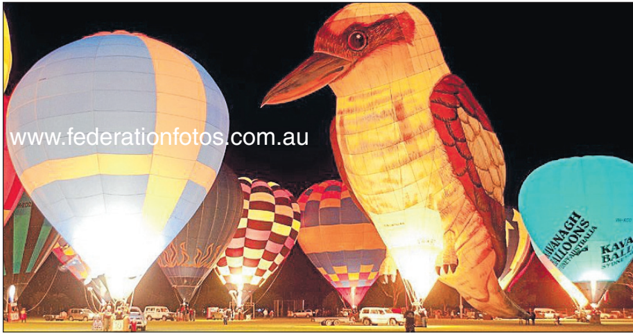
The evening Balloon Glow is a Canowindra Balloon Championships highlight.

Motor home and caravan accommodation, with powered sites, is available at the tree-studded showground, (bookings essential) and just across the road from the Balloon Glow overlooking the nine-hole golf course