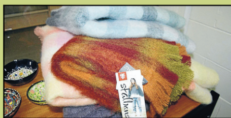
St Albans Mohair Throws