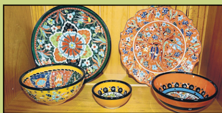
Hand Painted Turkish Ceramics

Come and See many more exclusive gifts at shop 14 Cassidys Arcade Queanbeyan