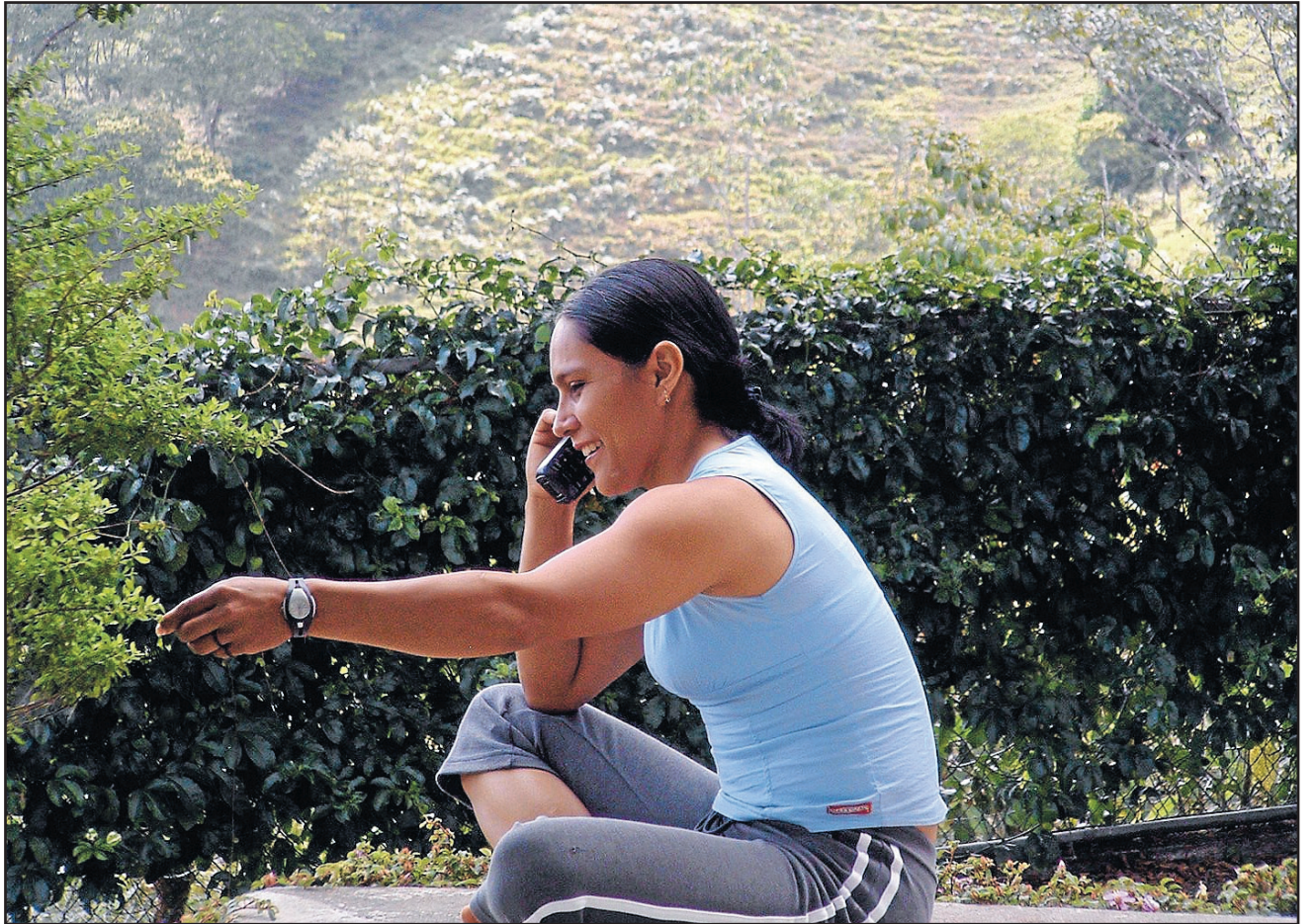
A new survey into the phone habits of Australians has found that half of NSW residents call their mum at least once a week.