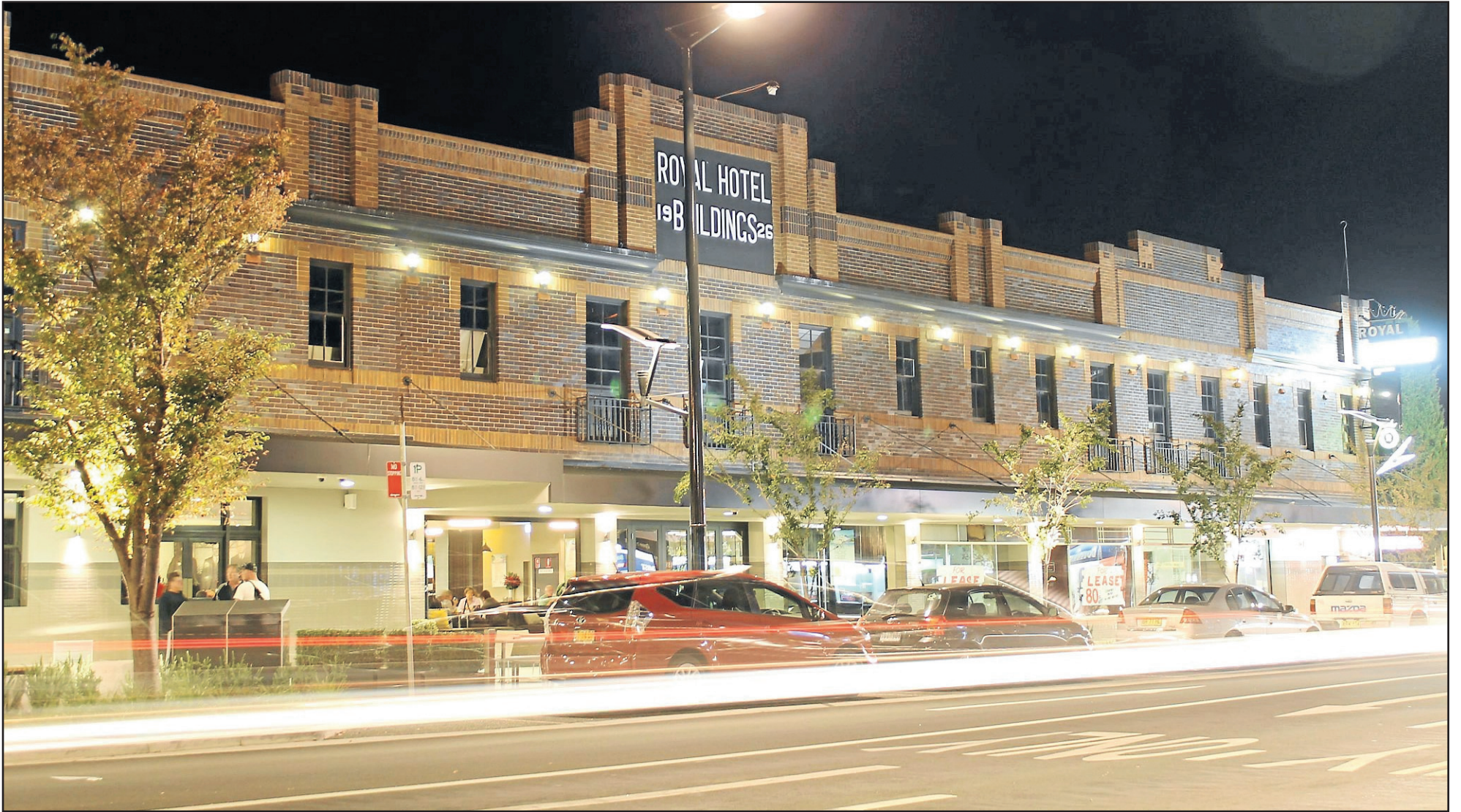
The Royal Hotel was opened in 1850, rebuilt in 1926 and underwent extensive renovations in 2012 to win the AHA's 'Best Renovated Hotel' in NSW in the same year.