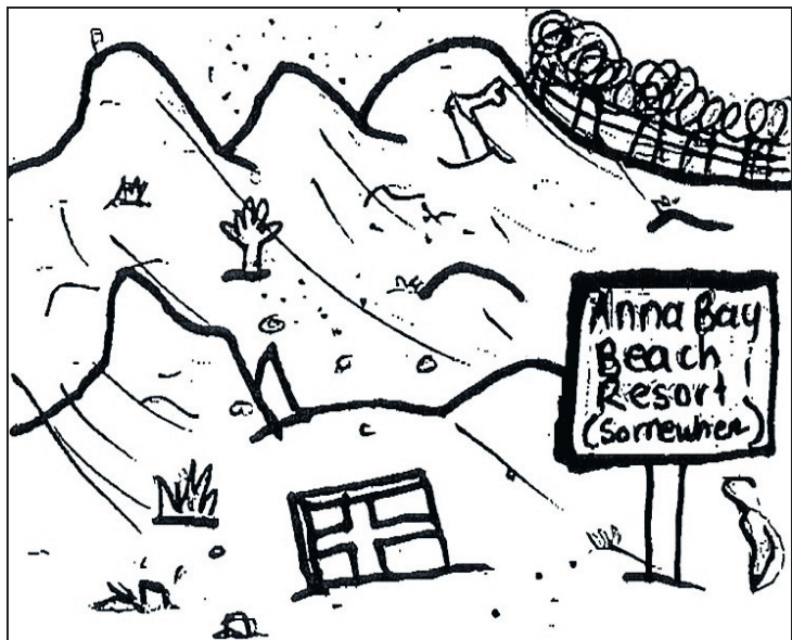
Cartoon: Geoff Churchill

The onus therein lies with the developer and hopefully they will ensure all environmental issues are dealt with and the building is aesthetically sound.