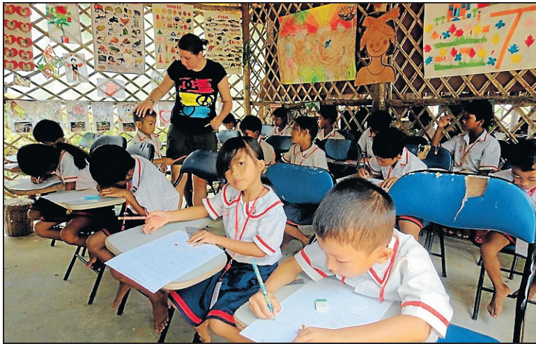
LEARN: Children in Siem Reap are benefiting from St James' generosity.

We can be giving to our family members and friends by being friendly and on their special occasions giving them gifts of thanks. Giving is a great way to make friends and show others you care.