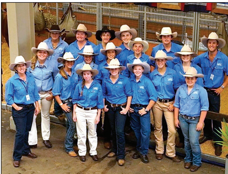
CHAMPIONS: Students and teachers of St Joseph's High School Aberdeen at Sydney's Royal Easter Show.

"The second place in the herdsmen [best maintained team] com-