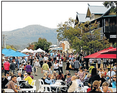
GOURMET TIMES: Denman's Wine and Food Affair.