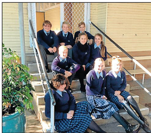
OUTPOST: Year 8 students at the annexe.

As well as the trade categories, several student also excelled in the paraders competition.