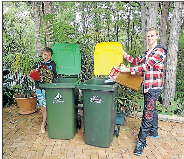
GOING GREEN: Most Lake Macquarie families are excited about the new green waste service to the Lake Macquarie area.

"We feel really lucky to be participating because it is a fun way to learn new skills," he said.