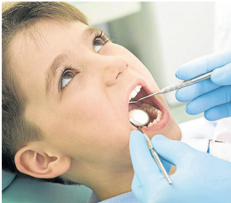
Free care ... children are the big winners of the new dental scheme.

Howard government, Mr Abbott in 2007 introduced a Medicare-funded dental scheme for sufferers of chronic disease.