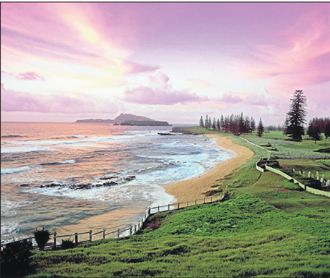
Norfolk Island is a lush, beautiful location with sandy beaches, jagged cliffs and tall pine trees. Its unique geography attracts tourists from around the world.