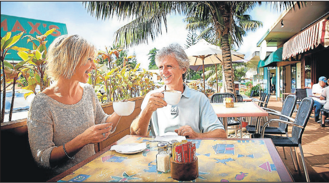
Sharing what you grow is built into the fabric of Norfolk society. On an island where flavour means life, you're guaranteed to find it everywhere.