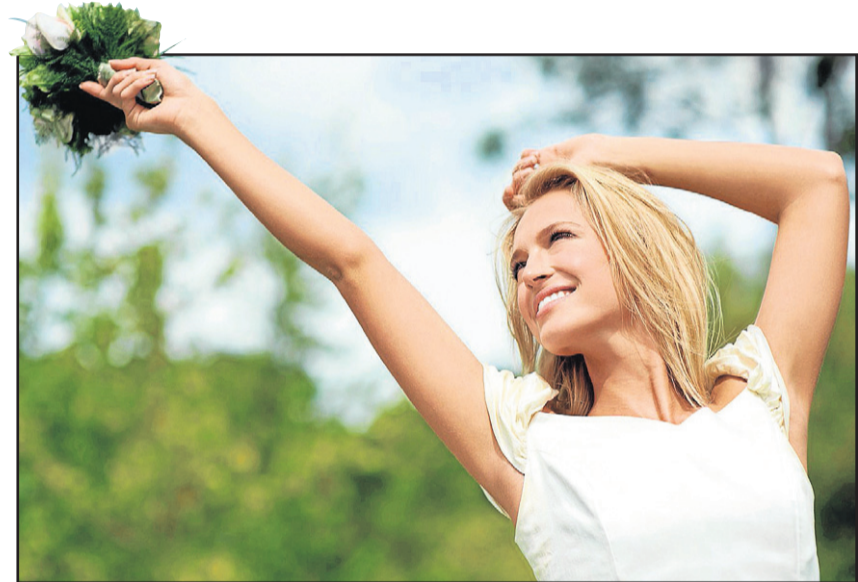
Celebrate wedding season with Nowra's newest function venue, The Douglas Centre.