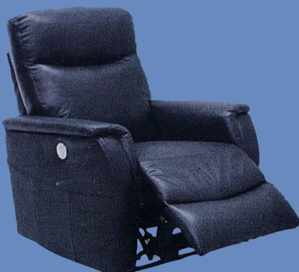
"Carlton" Powered Leather Recliner