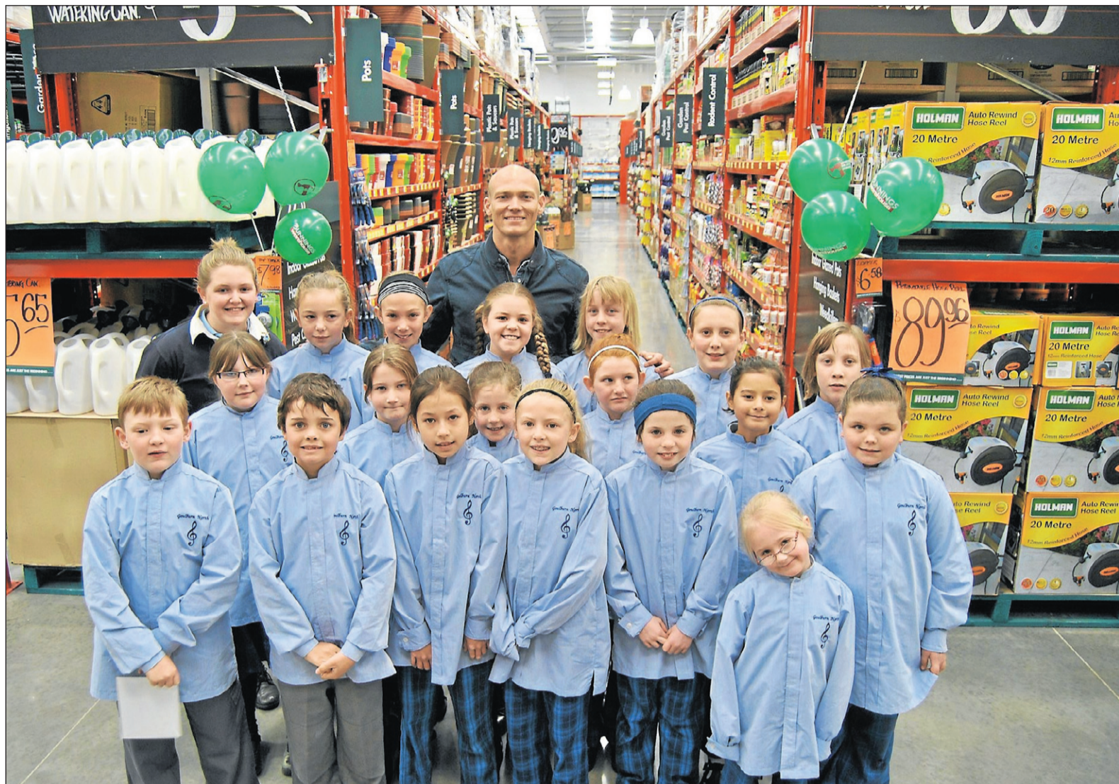
SPORTING HERO: North Goulburn Public School students were excited when yesterday they met two-time Olympic Gold Medallist Michael Klim at the local Bunnings Warehouse's official opening.