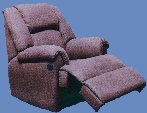
"Ben" Powered Recliner