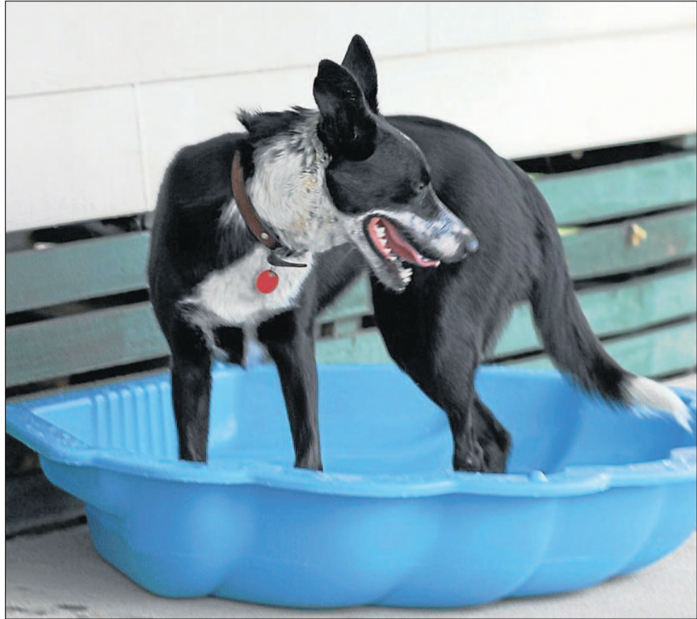
• A paddling pool will help your pet beat the heat this summer.

"It is much hotter in the car than out... having a window down is not enough."