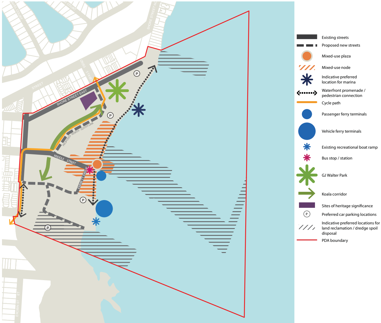
Map 2 - Structure plan