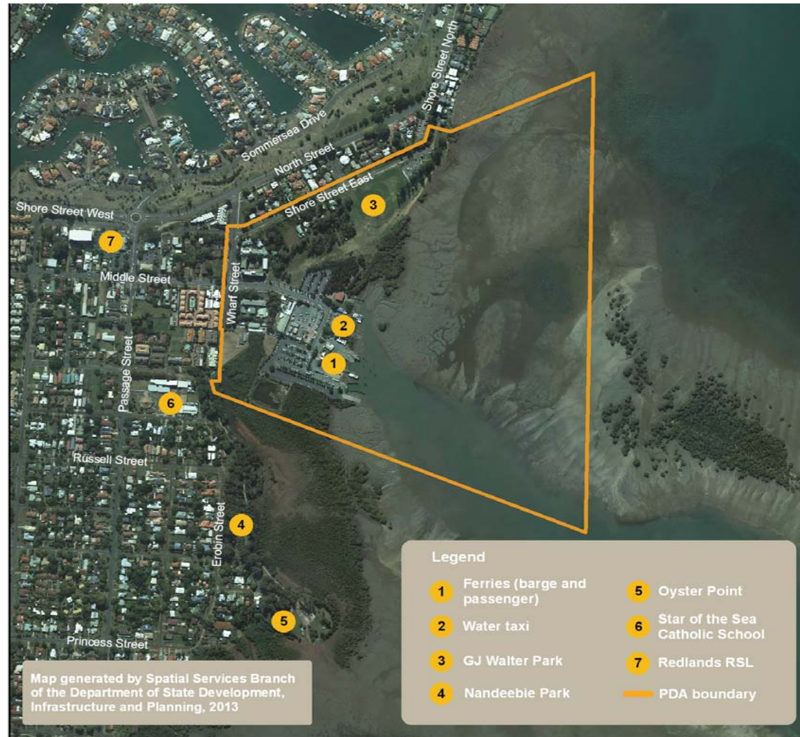
Map 1: Toondah Harbour Priority Development Area boundary

Toondah Harbour acts as the main point of departure and arrival for vehicular ferry and water taxi services between the mainland and North Stradbroke Island. The area incorporates marine activity, residential development and open space areas.