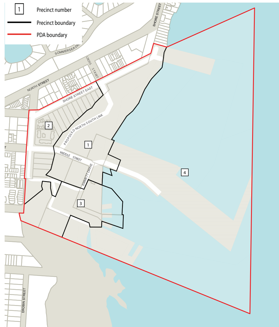
Map 3 - Precinct plan

The intent of Precinct 1 has been broken into 3 elements including Residential development and the mixed use node, Open space and Street and movement network.