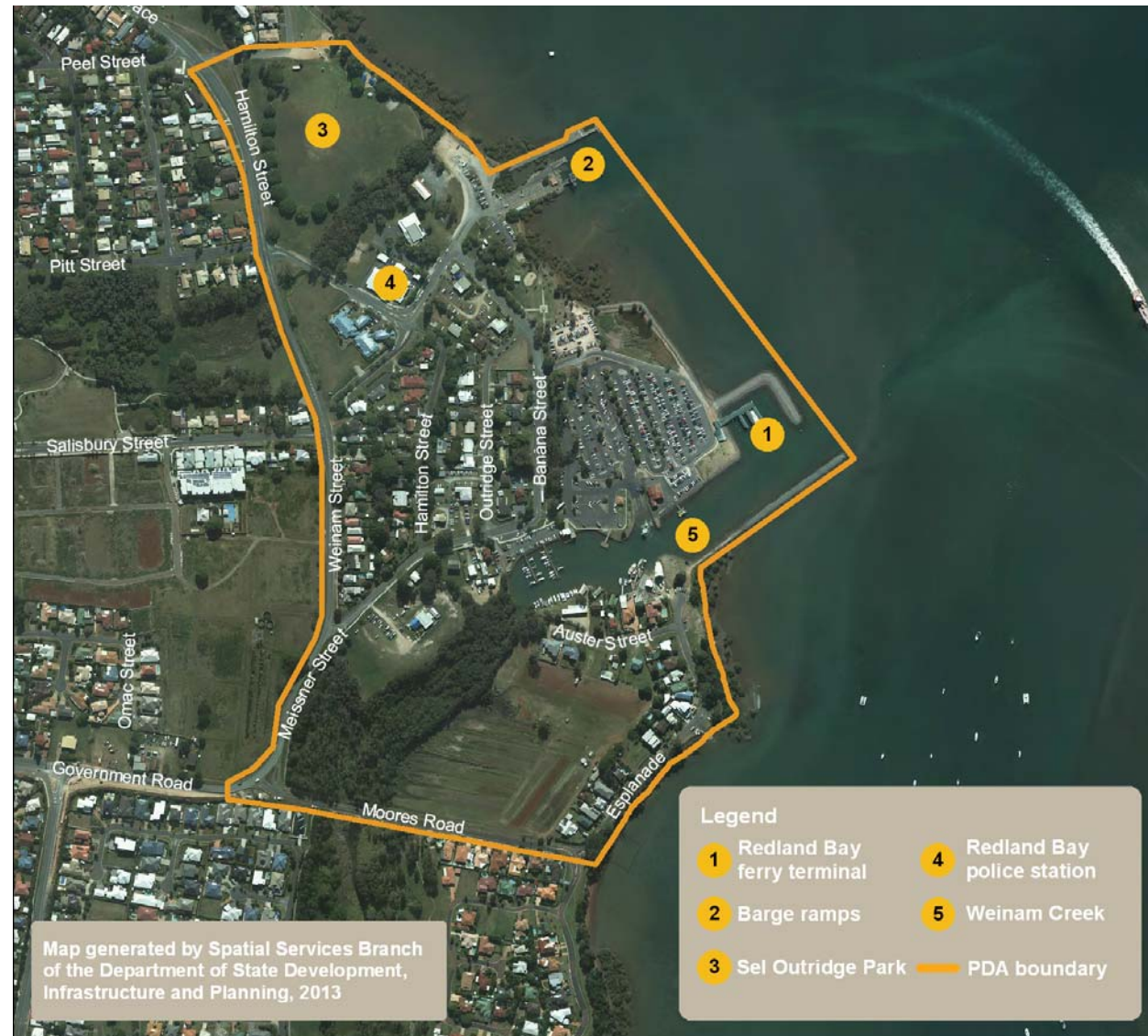
Map 1: Weinam Creek Priority Development Area boundary

The PDA incorporates the Weinam Creek Marina located at the intersection of Banana Street and Meissner Street.