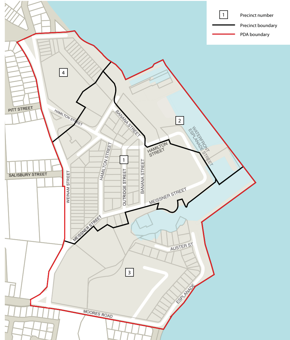
Map 3 - Precinct plan

Development will need to have regard to how it interfaces with Sel Outridge Park in Precinct 4 and contributes to activating