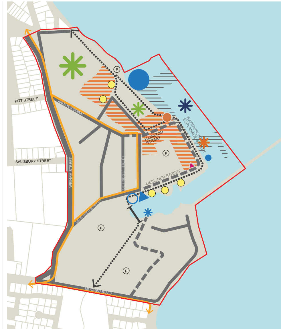
Map 2 - Structure plan