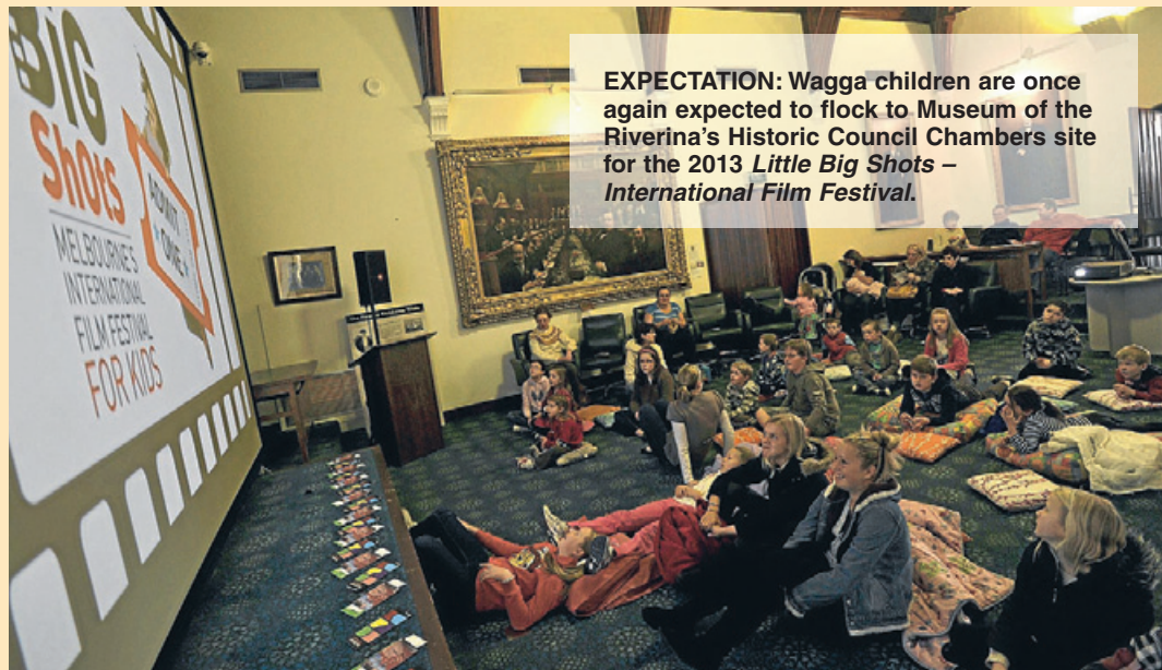
EXPECTATION: Wagga children are once again expected to flock to Museum of the Riverina's Historic Council Chambers site for the 2013 Little Big Shots – International Film Festival.

Bookings are essential. Phone 6926 9655 or email museum@wagga.nsw.gov.au .