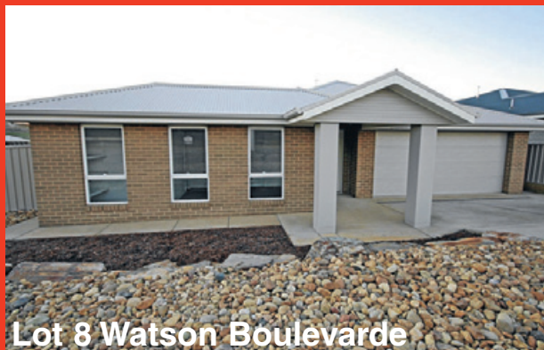
Lot 8 Watson Boulevard