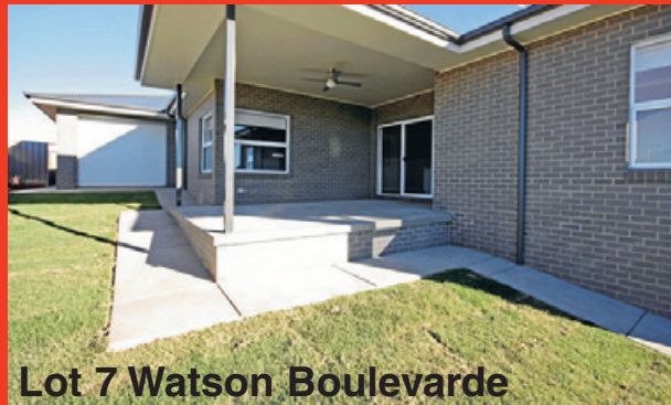
Lot 7 Watson Boulevard