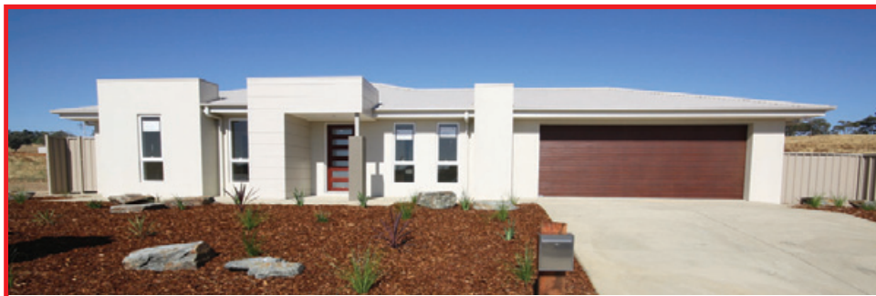
Lot 15 Lingiari Drive, Lloyd

View Today 11.00 - 3.00 pm Mark Kennedy 0418 692 511