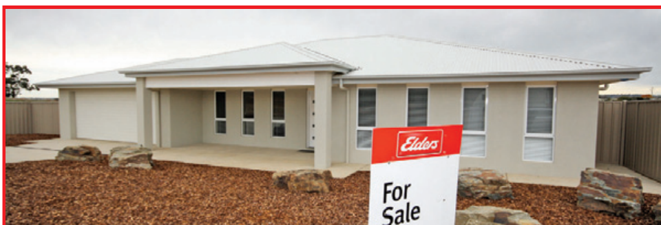
Lot 23 Preston Crescent, Lloyd