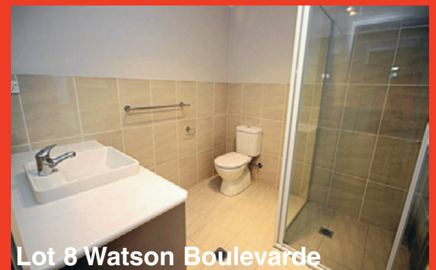
Lot 8 Watson Boulevard