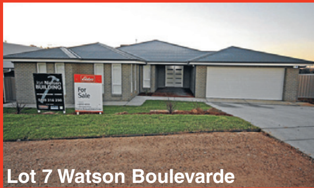
Lot 7 Watson Boulevard