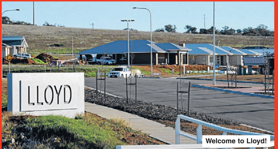
Welcome to Lloyd!