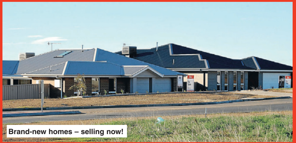
Brand-new homes – selling now!