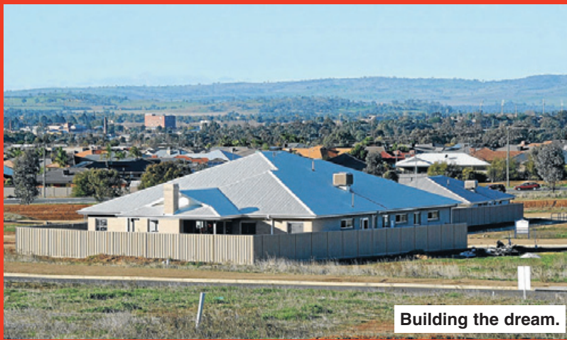
Building the dream.

Also, in a first for Wagga, all blocks will be connected to the all-new National Broadband Network. Residents at Lloyd West will enjoy the latest up-to-date internet connection Australia has to offer!