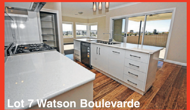
Lot 7 Watson Boulevard