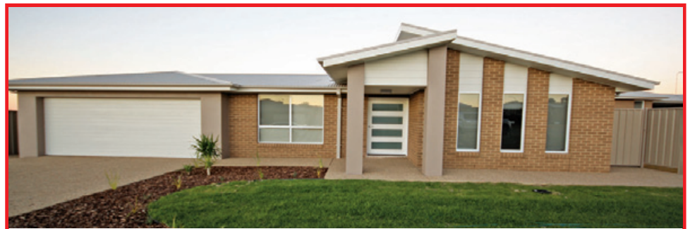
Lot 10 Lingiari Drive, Lloyd

View Today 11.00 - 3.00 pm Stephen McDonell 0408 474 801