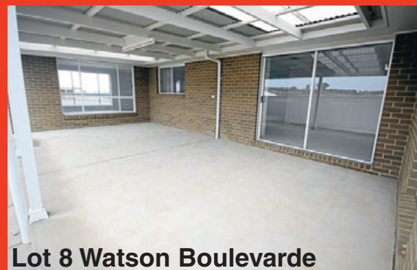
Lot 8 Watson Boulevard