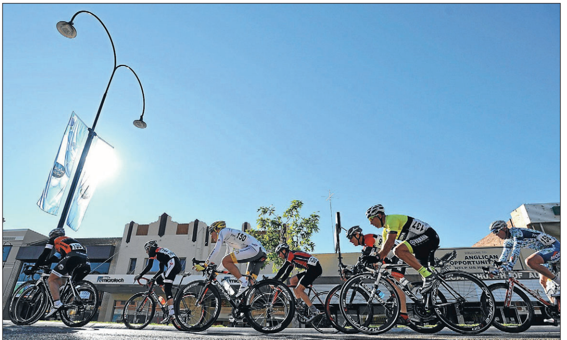
PICTURESQUE: Cyclists ride along Fitzmaurice Street during yesterday's Wagga Cycle Classic criterium event.