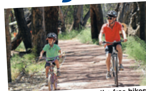
Explore Hay on the free bikes!

Hay has a wide range of accommodation from motels, caravan parks, self-contained