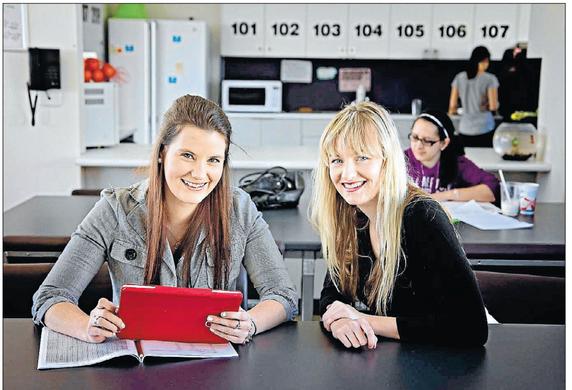
RICH EXPERIENCE: Enjoy university life at Charles Sturt University.