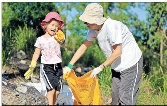
COME CLEAN: Get set for Clean Up Australia Day on March 2.

The organisation does not receive government funding and relies on private or corporate donations to keep its campaigns running.