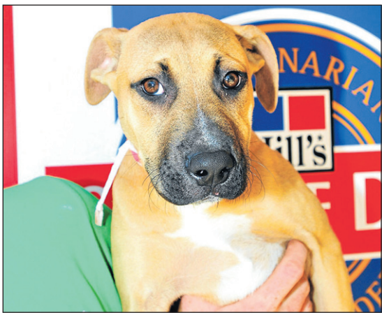
BIG GIRL: Jade is just a puppy now but will grow to be a big dog with a big heart.